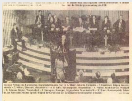
Once upon a time, the ETUC creation in 1973