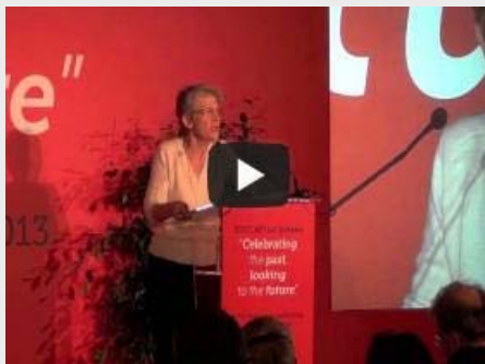
#ETUC40: all the videos