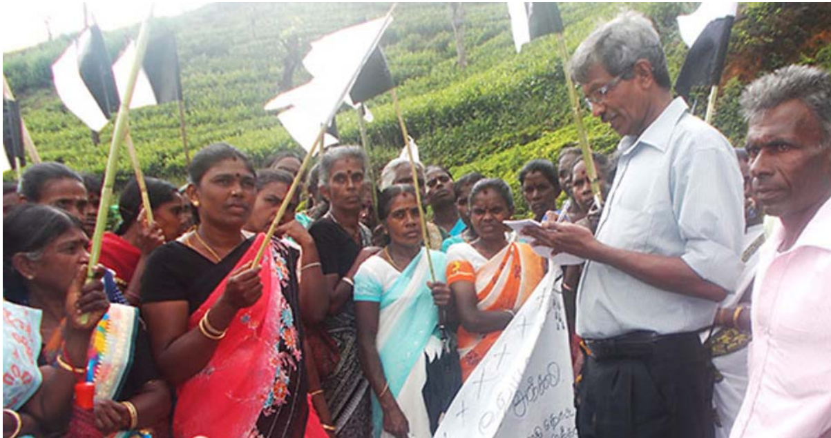
WSWS correspondent speaking to protesting estate workers in Sri Lanka

The WSWS is the global center for the political organization of the working class. It is the product of co-thinkers in countries around the world working together in real-time towards a single purpose: the unification of the working class on a socialist basis to put an end to the profit system and its barbarism. The WSWS bases itself on the common interests of all workers on the entire planet and rejects every form of national chauvinism that pits workers against workers.