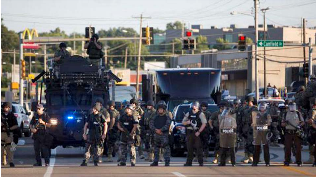
Police in Ferguson

Imperialist war and social inequality are inextricably linked to the destruction of democratic rights. Toward the end of the year, the release of the Senate report on CIA torture has exposed criminality at the highest level of the state. Laws and the constitution are blatantly violated, and yet no one is held accountable. Meanwhile, those who have sought to expose criminality--such as Edward Snowden, Chelsea (Bradley) Manning and Julian Assange--are in prison or have been forced into exile.