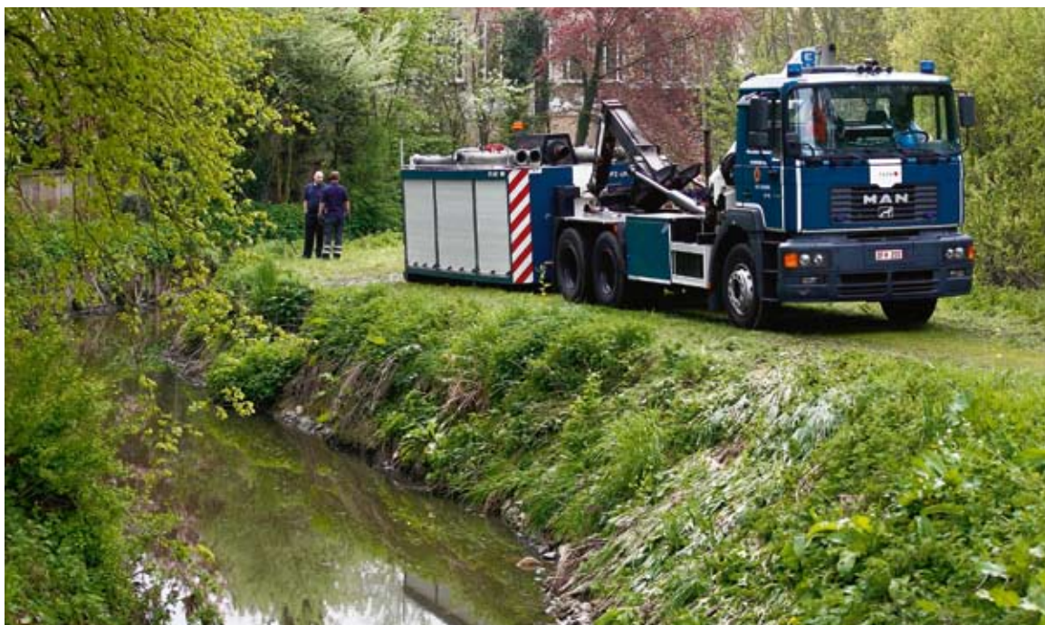
Passers-by found a thigh bone wrapped in plastic in the Heule stream