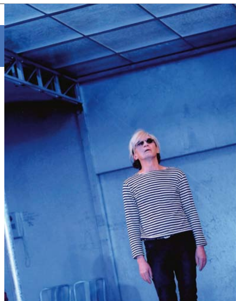
Polish theatre legend Krystian Lupa's Factory 2 is an imaginary scenario based on Andy Warhol's New York studio The Factory