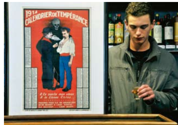
© Hasselt. Jenever Museum, The Art of Drinking