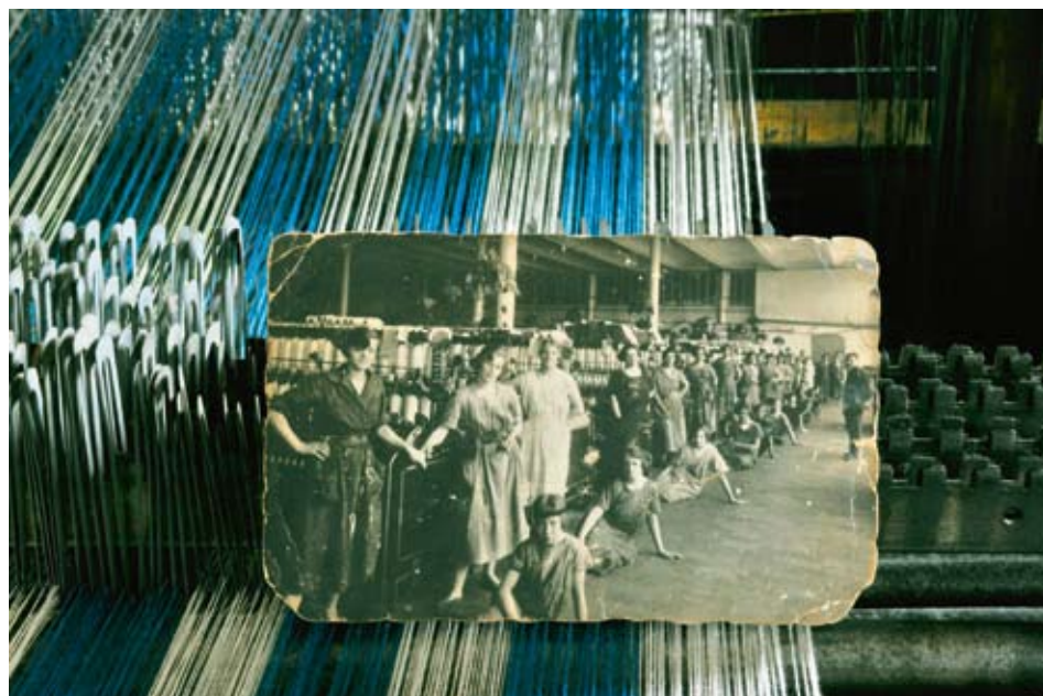
© Gent. M&amp;AT, spinning mill Vooruit, 1926