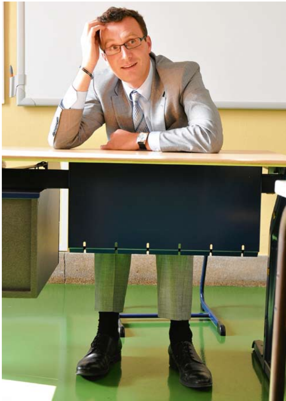
Pascal Smet visits a school in Bredene on the Belgian coast last autumn

Dutch-speaking education, he says, is supposed to be for Dutch speakers in the first instance. "The city is predominantly French speaking," he says. "If you offer Dutch-speaking education to people who speak Dutch at home, you have to give them priority, just as we give priority to children who come from socially disadvantaged backgrounds, and just as we give priority to brothers and sisters."