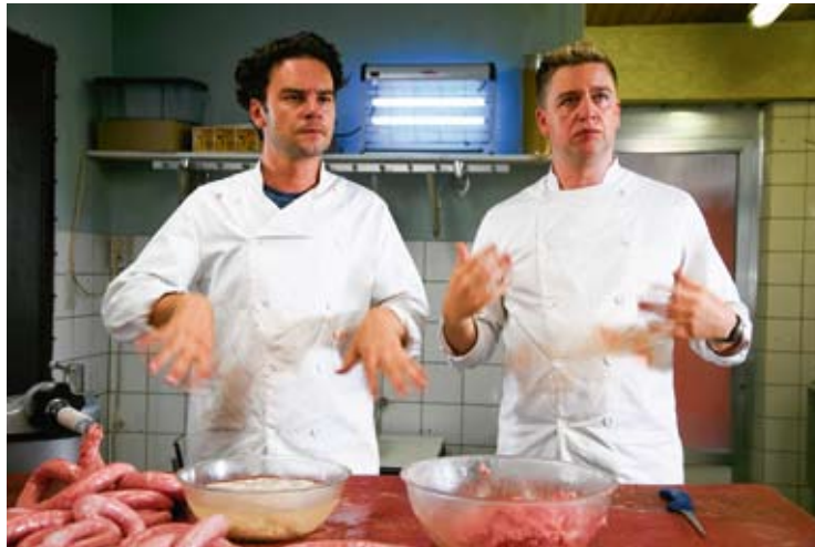
The 2009 drama series Van vlees en bloed , produced by Woestijnvis