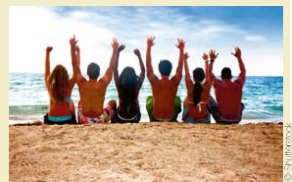
Assume the position

The plan is based on a similar scheme deployed in Rotterdam, a city not exactly known for its bucolic inner-city environment. And it's met with opposition, not only from those who wear