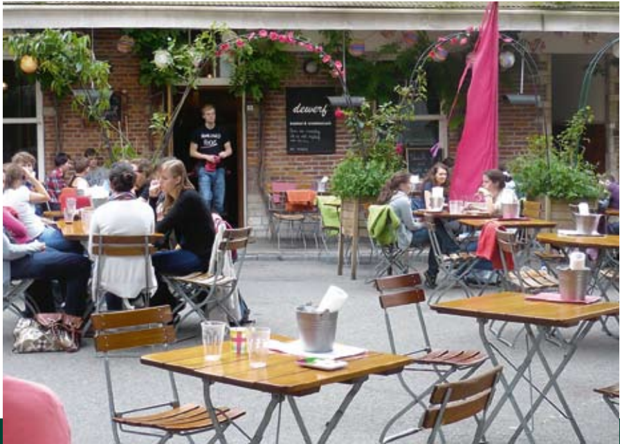
The Leuvenaars ' favourite meals under €10 can be had at De Werf

If your budget is a little bigger, try Kokoon just down the street, which is still considered a great value by Leuvenaars , with its modern, gastronomic take on fish and lamb. Kokoon is located just off the Muntstraat, Leuven's own restaurant alley. Don't worry, it's not a tourist trap; locals eat here, too.