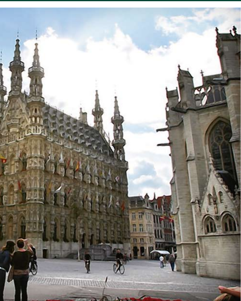
ough to get it all in frame from the front; to its right is Sint-Pieters Church, to its left the currently absent Fonske

If you've decided to forgo a big holiday this year, that doesn't mean you have to spend summer days at home. This month in Flanders Today, we'll show you the best places in Flanders to while away a week