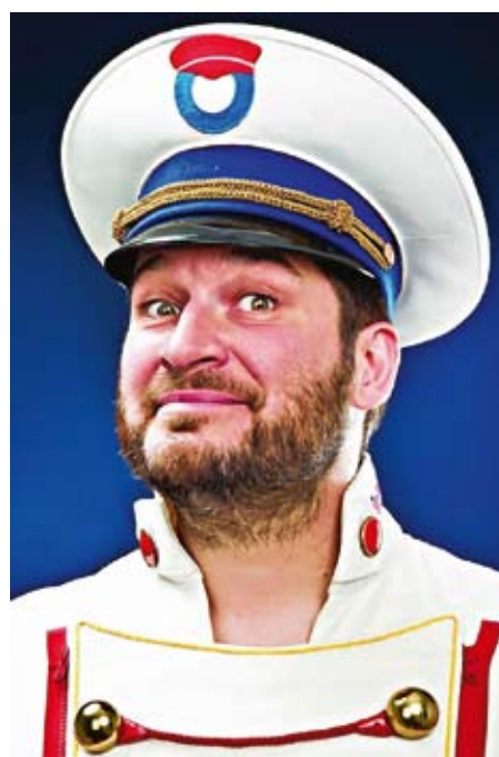
If you are a child...