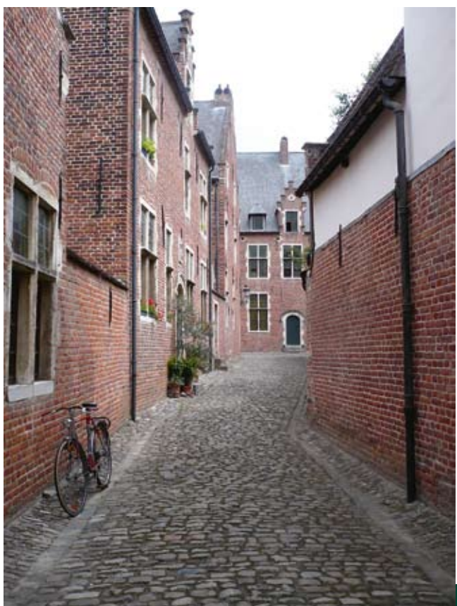
Leuven's Groot Begijnhof is the most beautiful example of its kind in Belgium

What I find paradise are the discoveries to be made in the Heverlee wood, just outside the centre along Kardinaal