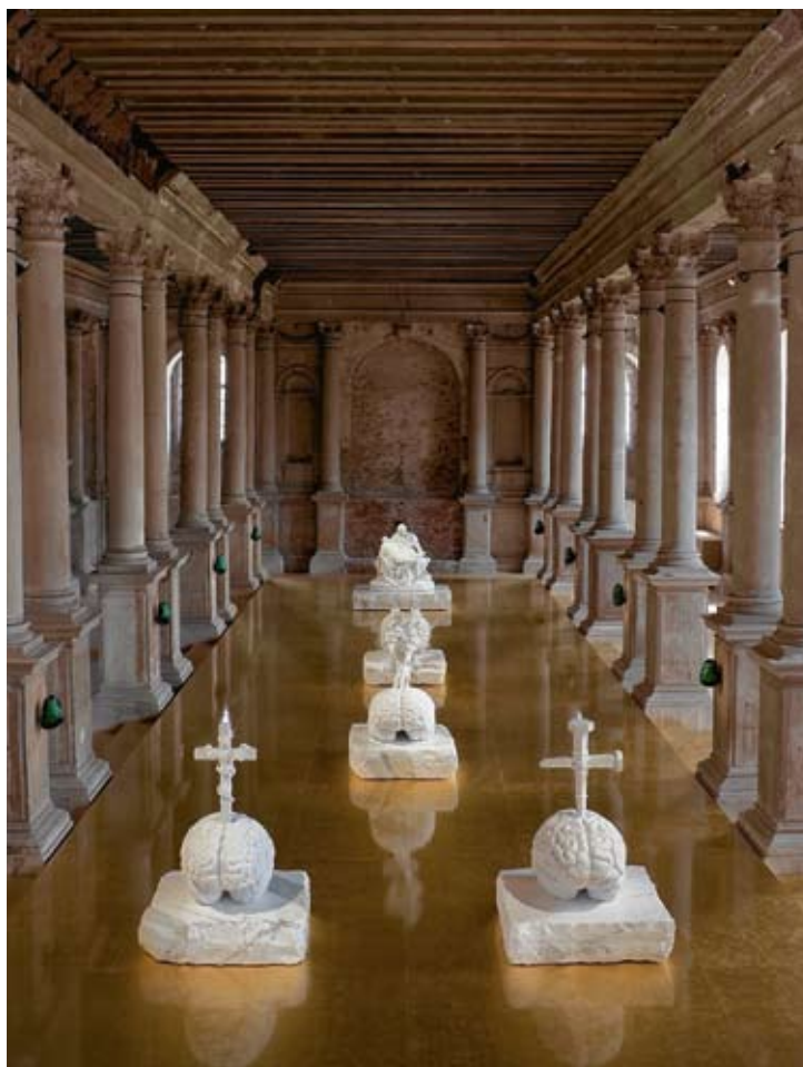
The talk of Venice: Jan Fabre's "PIETAS"