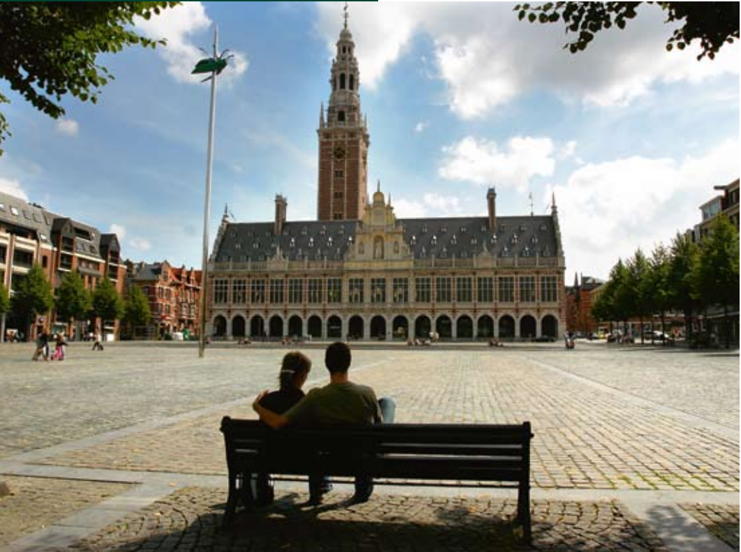
Romance and the bug: Jan Fabre's sculpture on the huge square of the university library