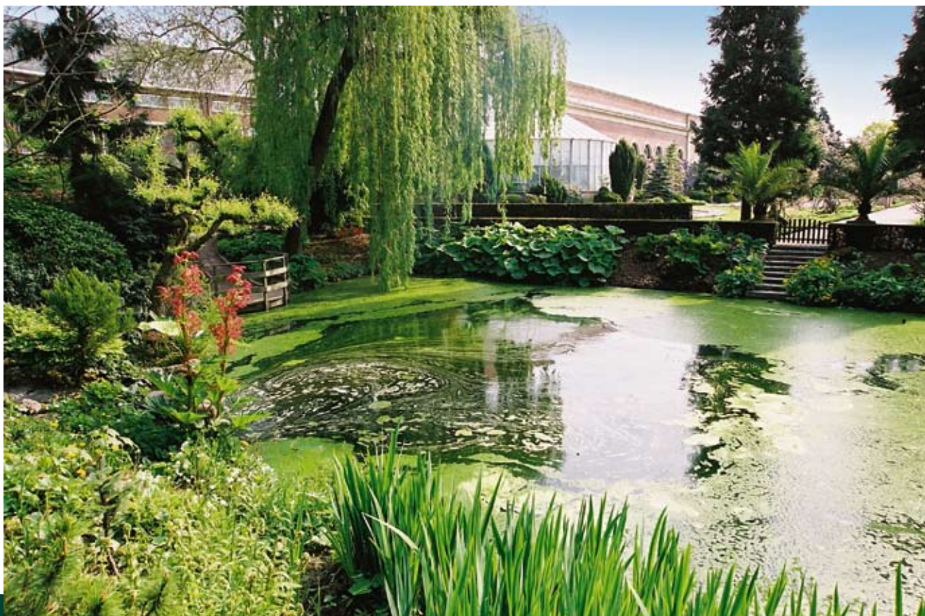
Leuven's picturesque Botanic Garden is free of charge and open late