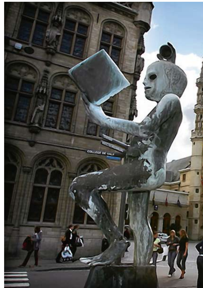
Leuven's super Goth city hall is always photographed at an angle because the square is not big enough.

But this is a summer holiday, after all, so to the outside. In the south of Leuven's city centre is the Groot (Large) Begijnhof, one of the most lovingly maintained communities of its kind.