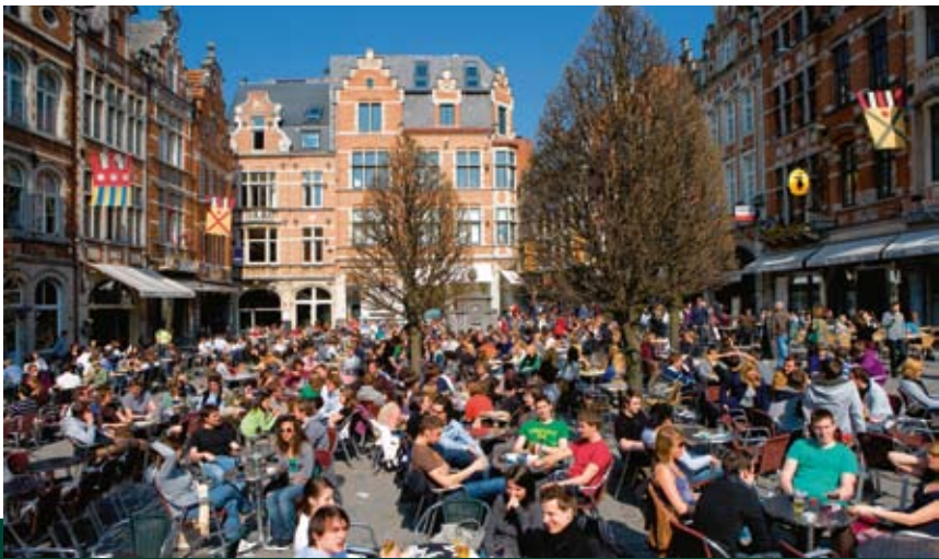
Sun and students on the Oude Markt (hint: in the summer, most of the students are gone)