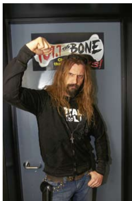
If you are hardcore...