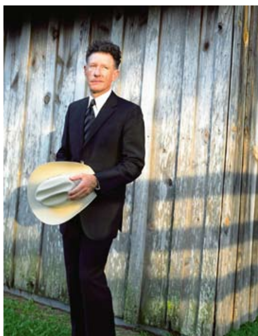
If you are serene...