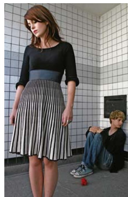
If you hate routine...