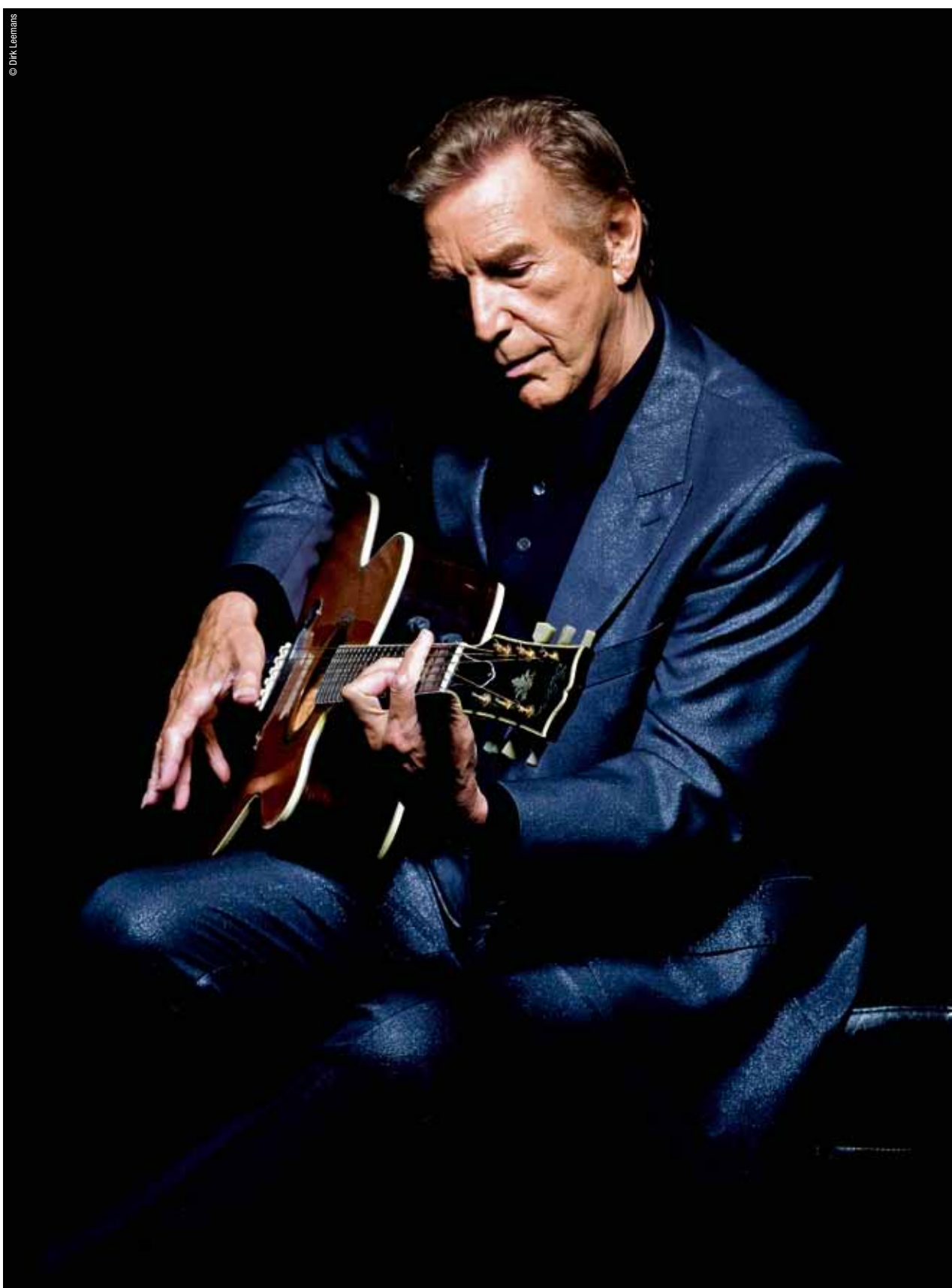
Flanders' most enduring musical celebrity, Will Tura, whose life and career are being celebrated with a new book and an exhibition

By the end of the 1980s, when the first Flemish commercial TV channel appeared, he took advantage of the renewed interest in local artists; with the catchy “Mooi, 't leven is mooi”