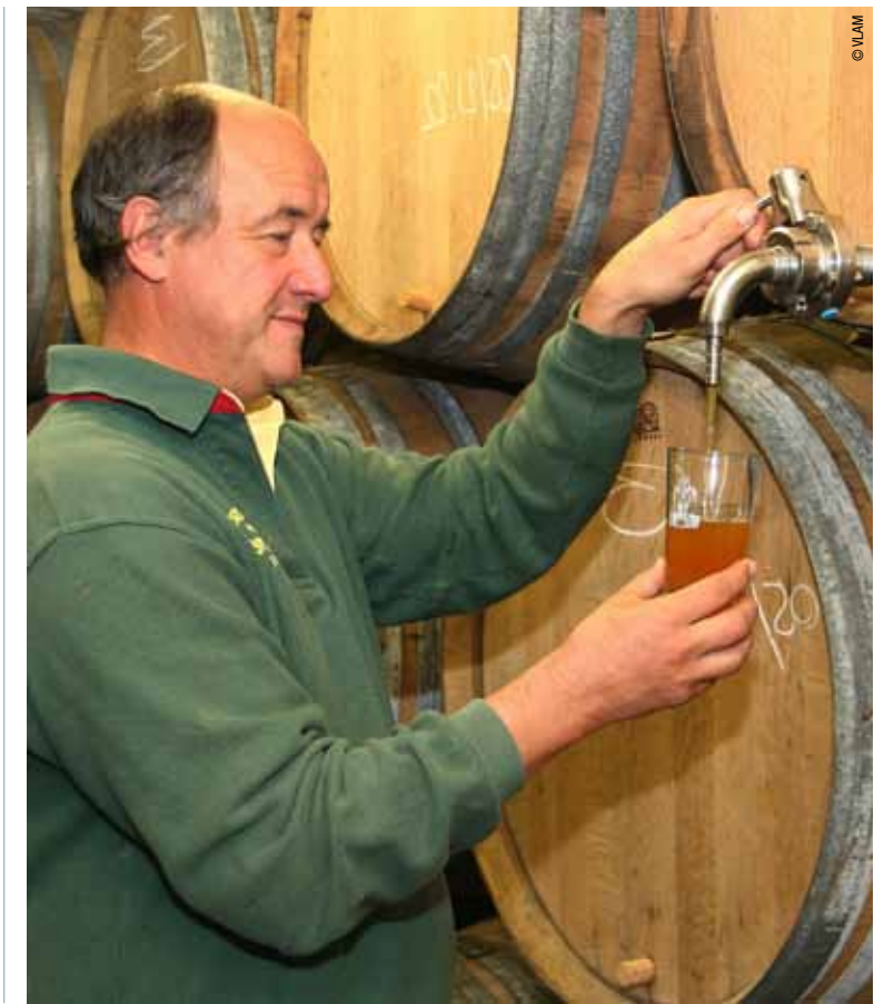
The oak casks of the 3 Fonteinen brewery in which the old geuze matures