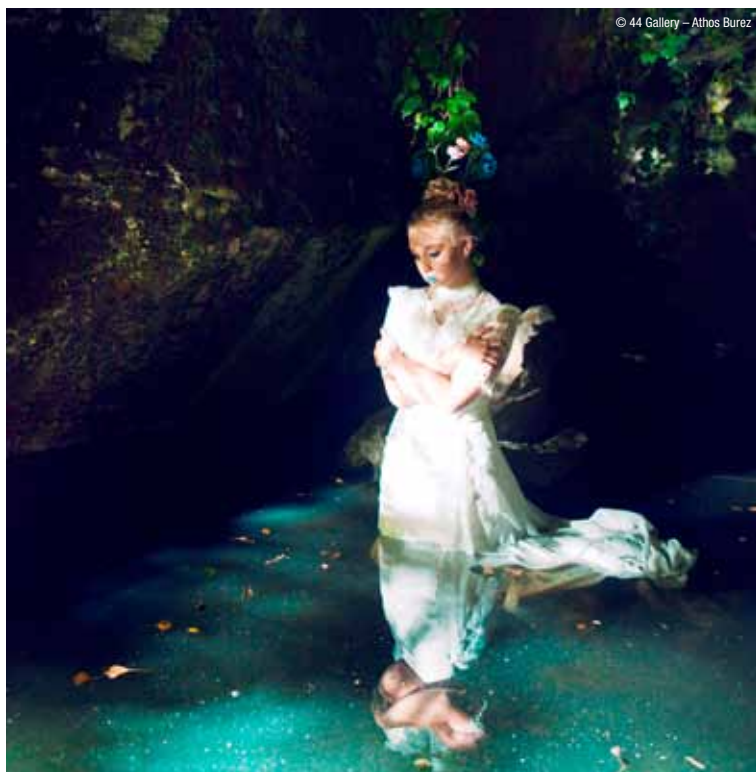
"Happiness" by Athos Burez, just one of many magical works featured in Wonderful World

In the Pinsart gallery we encounter, among many others, urban sketches