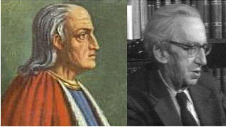
Lukács is the St. Anselm of XX century!

communist creed” (p. 157) in such a way that “what has been projected by medieval philosophy as objectivity on God and eternal truth is incorporated by Lukács as an idol, as an untranscendable immanence into the ‘this-worldiness’ ...” (p. 158)